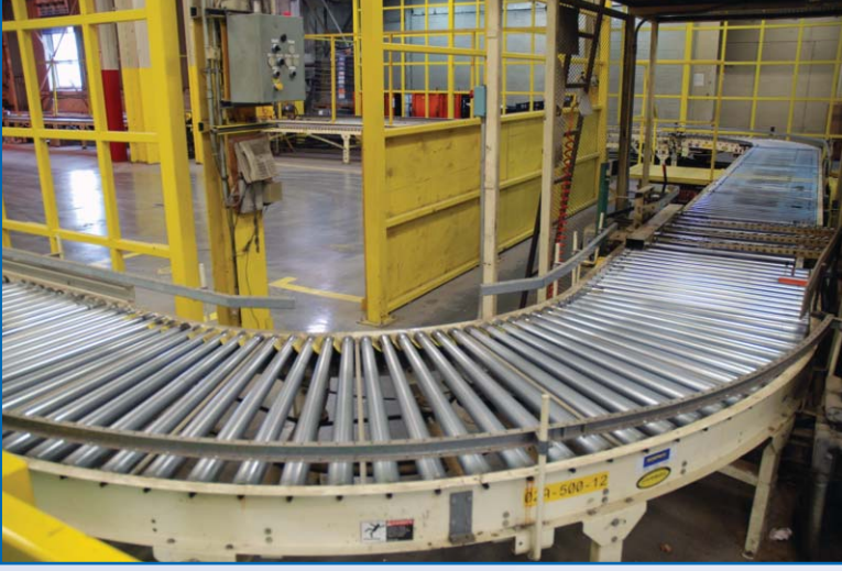
PARTIAL VIEW: 10,000' + HYTROL, MATHEWS, ROACH, MOODY POWER ROLLER AND BELT CONVEYOR