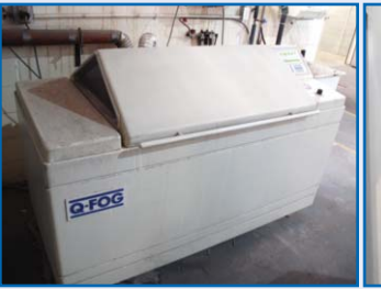
Q-FOG 600 LITER CYCLIC CORROSION TESTER