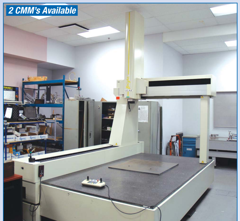
MITUTOYO BRIGHT 1220 CMM