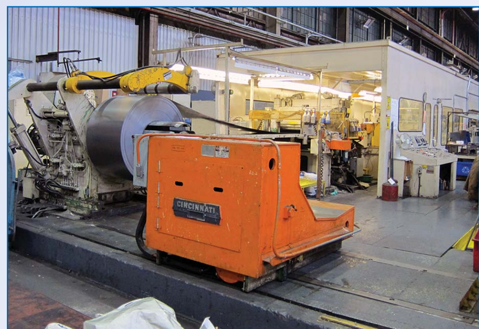
CINCINNATI .075"X 48"X 20,000 C-T-L LINE

ALSO; Large Quantity of Vacuum Lifts, Electric and Air Hoists etc