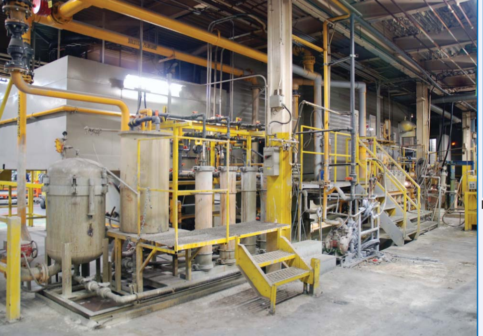
COMPLETE EISENMANN E COAT LINE