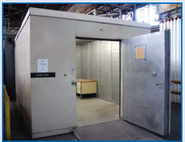
MODULAR SOUND ROOM