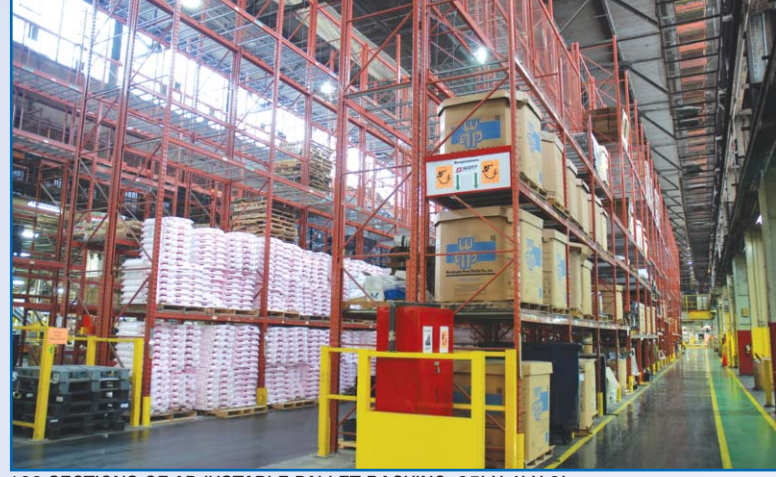
160 SECTIONS OF ADJUSTABLE PALLET RACKING: 35' X 4' X 9'