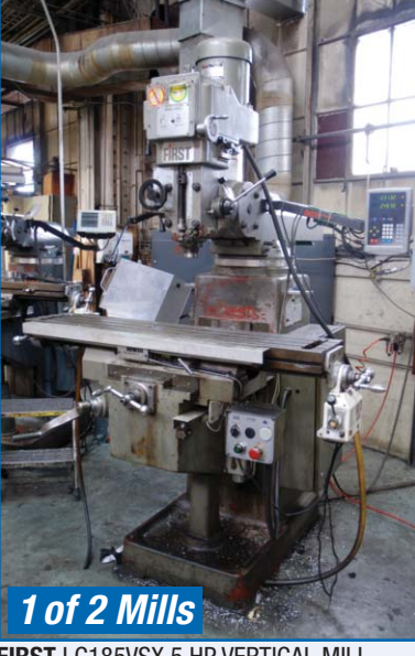
FIRST LC185VSX 5 HP VERTICAL MILL