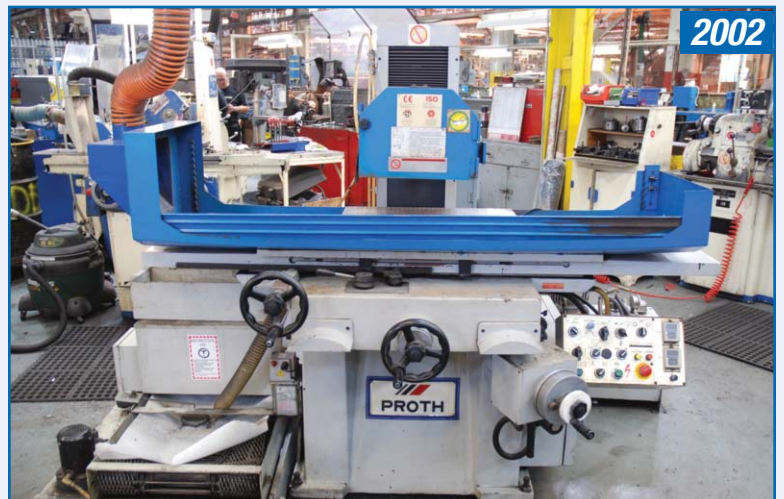
PROTH 12"X24" HYD. SURFACE GRINDER