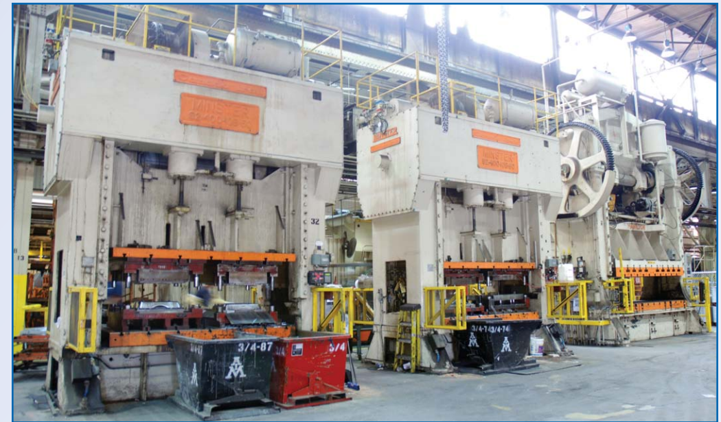
VIEW OF 2 MINSTER 400 TON & HAMILTON 1,000 TON STRAIGHT SIDE PRESSES