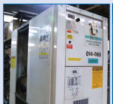
ICS CHILLER MODEL JSW.015 SCS