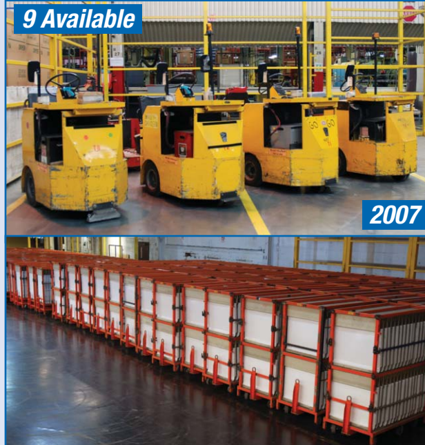
TAYLOR DUNN E0-034-51 ELECTRIC TUGGER TRUCKS PLUS TUGGER CARTS