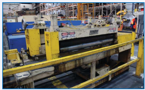
STRILICH 48"X .125" EDGE TRIMMER