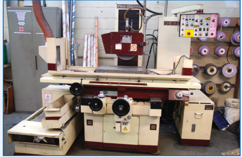
CHEVALIER 12"X24" HYD. SURFACE GRINDER