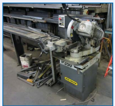
HYD-MECH P-350 COLD SAW