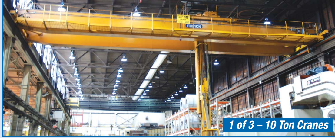
MUNCK 10 TON X 70' COIL HANDLER BRIDGE CRANE