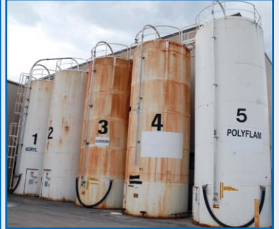
ANPLAST 30'X 12' SILOS