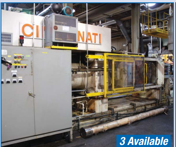
CINCINNATI 700 TON HYD INJ MOLDER