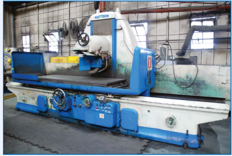
MATTISON 36"X 90" HYD. SURFACE GRINDER