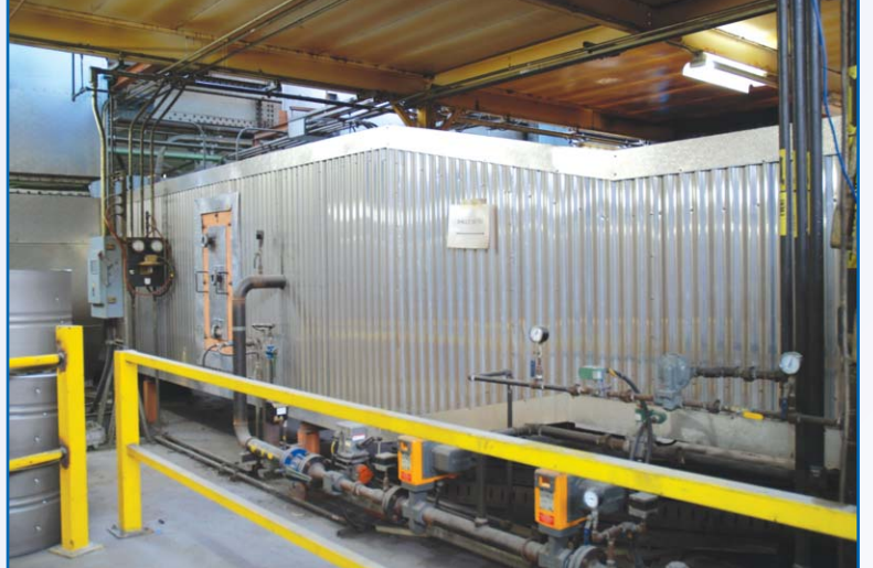
HEAT EXCHANGE SYSTEM

CONTROLLED PYROLYSIS PRC412 4722 Dbl Door Burn-Off Oven, s/n n.a., 52"w x 100"h x 120"d, 4'x 10' Car, Gas Fired