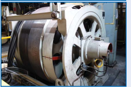
400 HP SPARE MOTOR FOR SCHULER PRESS