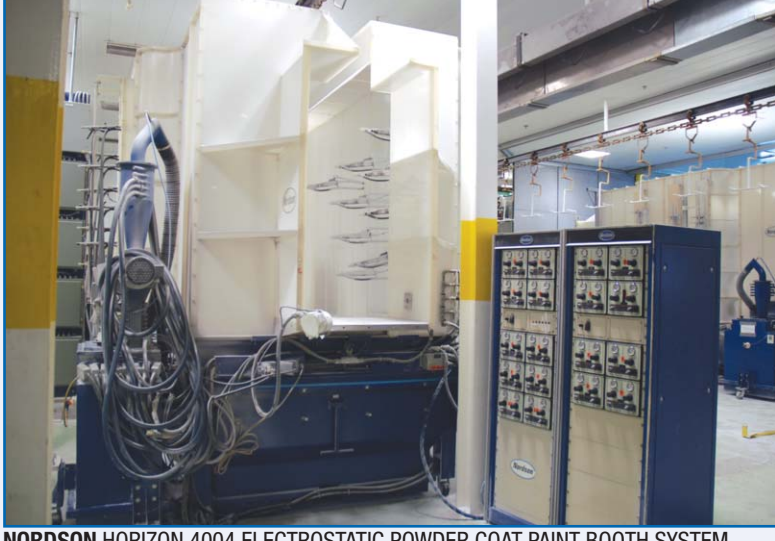
NORDSON EXCEL 2000 MODEL 2002S ELECTROSTATIC POWDER COAT PAINT BOOTH SYSTEMS NORDSON HORIZON 4004 ELECTROSTATIC POWDER COAT PAINT BOOTH SYSTEMS