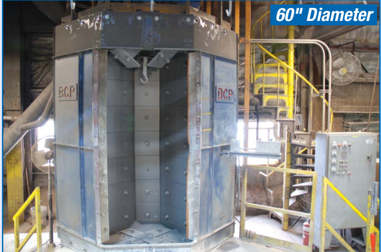
BCP ROTOBLAST SHOT BLAST