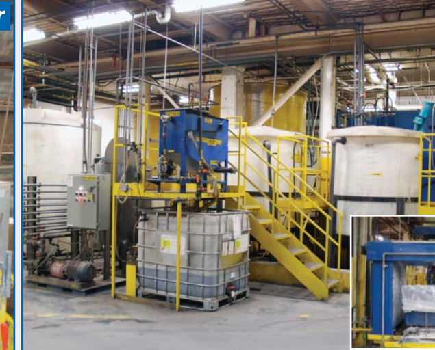
WASTE WATER TREATMENT SYSTEM