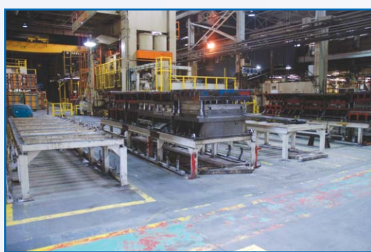
PARTIAL VIEW OF CLAMP SETS