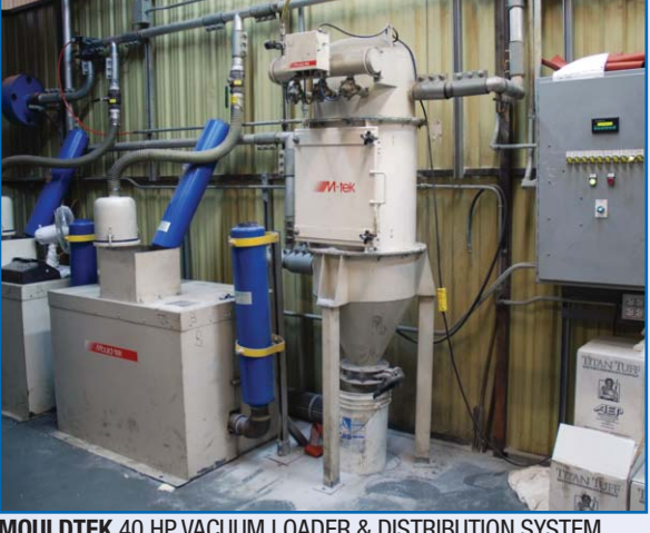
MOULDTEK 40 HP VACUUM LOADER & DISTRIBUTION SYSTEM