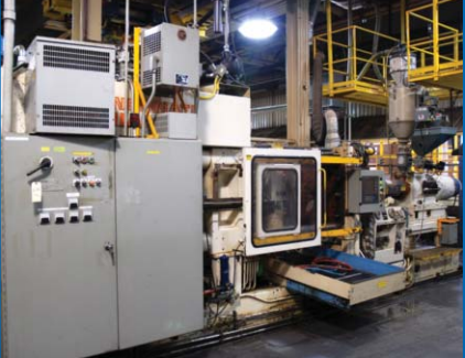
CINCINNATI 500 TON HYD INJ MOLDER