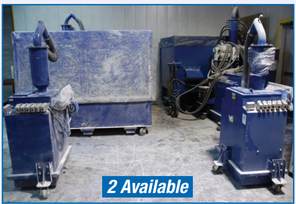
NORDSON QUICK CHANGE COLOUR MODULES & POWDER RECLAIM