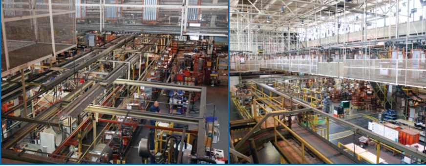
PARTIAL VIEW OF ASSEMBLY AREAS & CONVEYOR SYSTEM