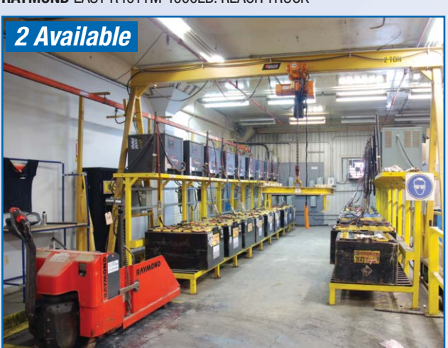
BATTERY HANDLING SYSTEMS HRS 120 BATTERY SERVICE STATION