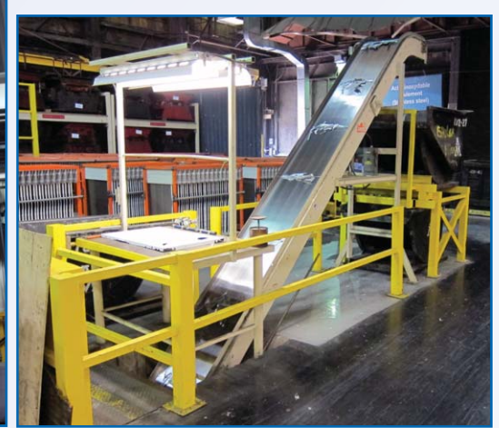
ERIEZ 250' MAGNETIC SLUG CONVEYOR SYSTEM

(5) HEAVY DUTY 60"x 20' Die Set Up Tables (3) HEAVY DUTY 22,500 lb Die Storage Racks MOTIVATION C-20-48.5 20,000lb. x 48" Coil Hook ALSO Die Clamping Sets; Die Rigging Hardware