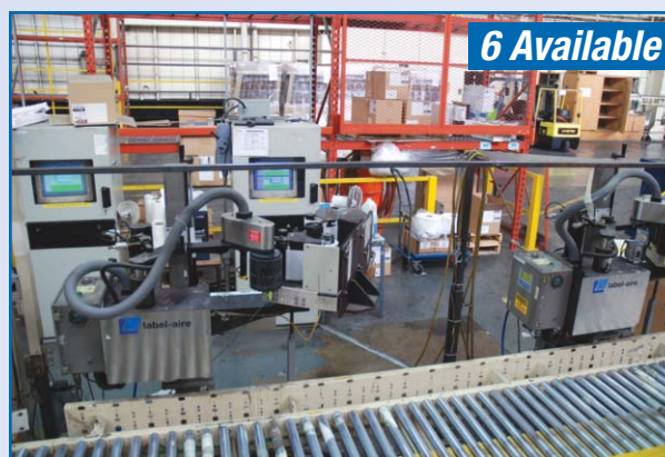
LABEL-AIR LABEL APPLICATORS