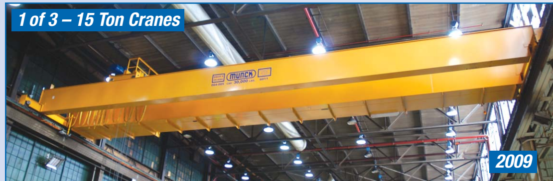
MUNCK 15 TON X 70' BRIDGE CRANE