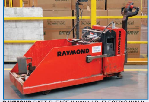
RAYMOND BATT-R-EASE II 3000 LB. ELECTRIC WALK TYPE BATTERY CHANGER