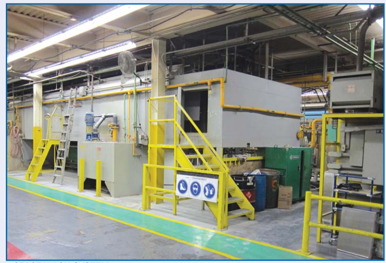
8 STAGE WASH SYSTEM